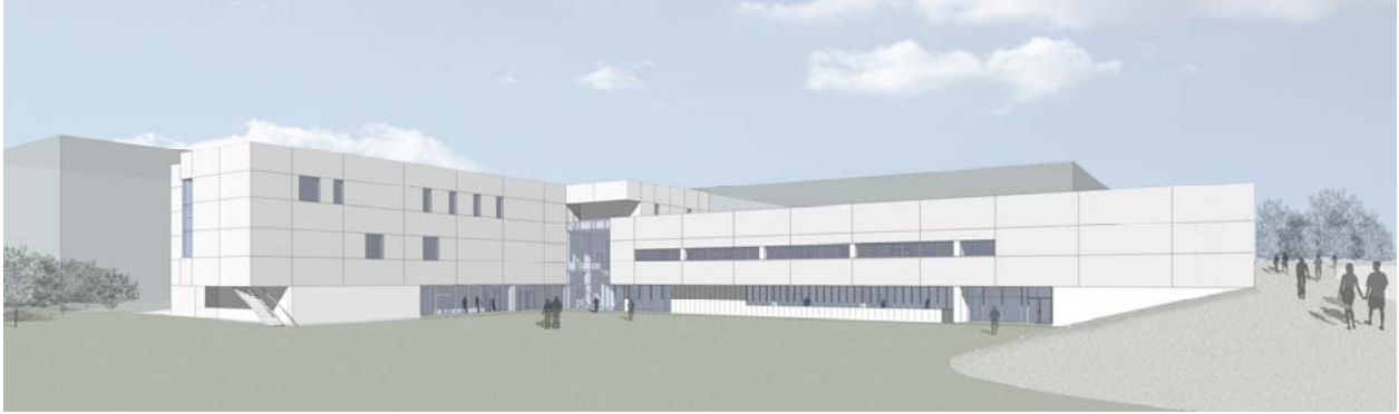
Building 4N as viewed from College Drive, looking west.