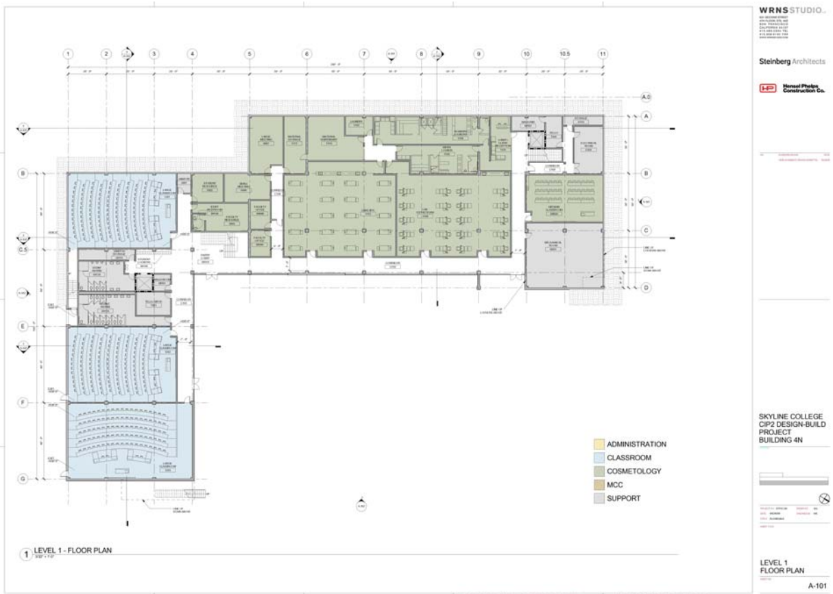
Building 4N, Level One Floor Plan (top of plan is west)