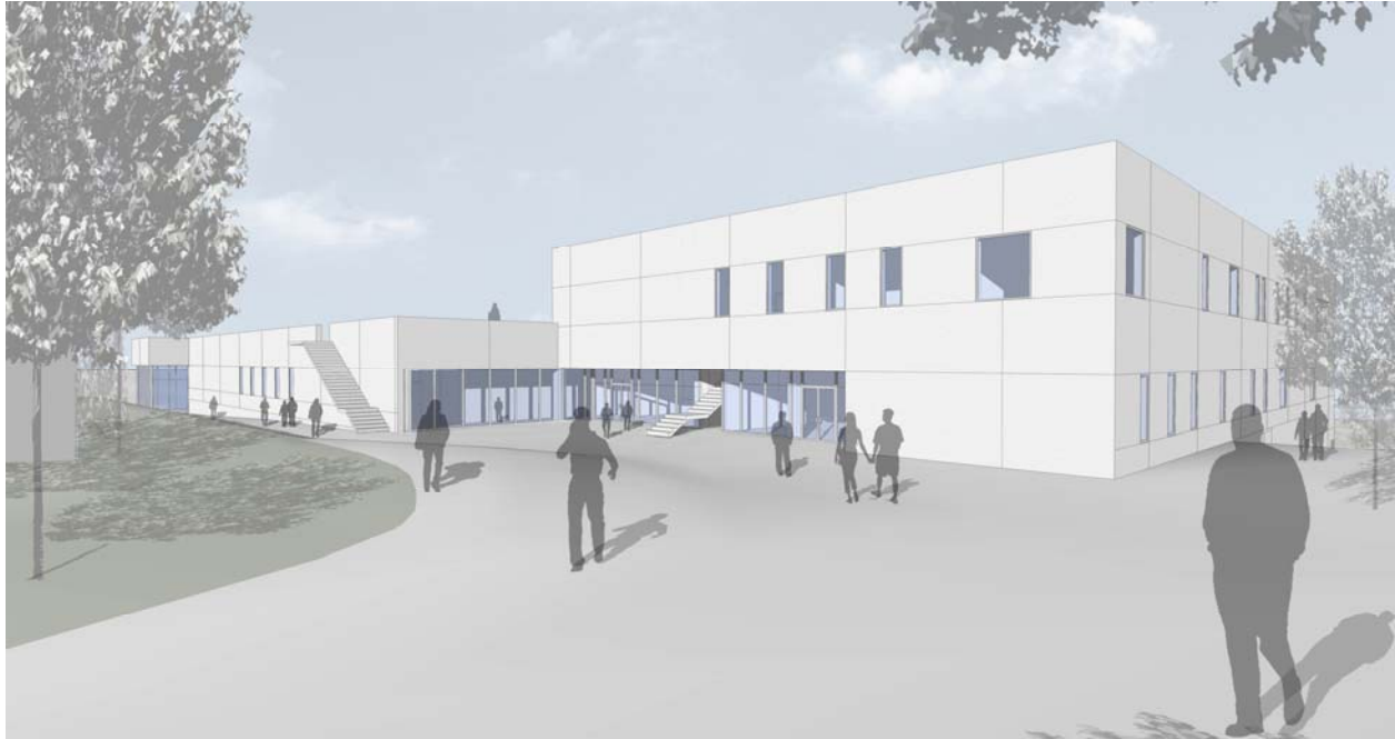
Building 4N as viewed from the center of campus, looking northeast.