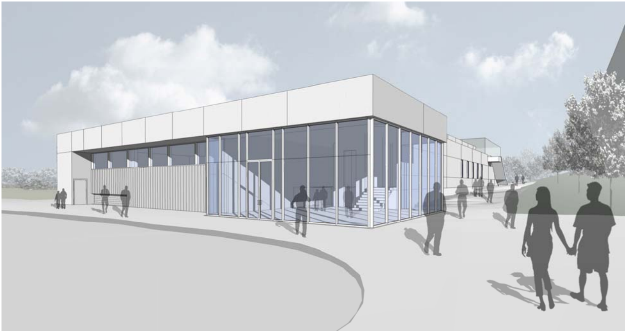
Building 4N as viewed from the drop off on the north side, looking southwest.